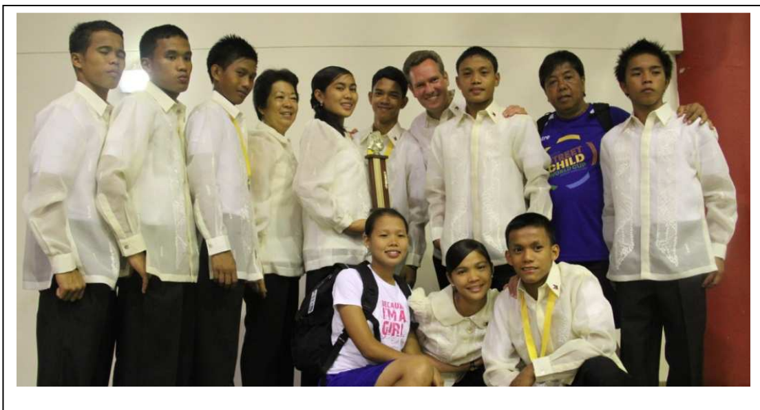
Dressed for success after victory